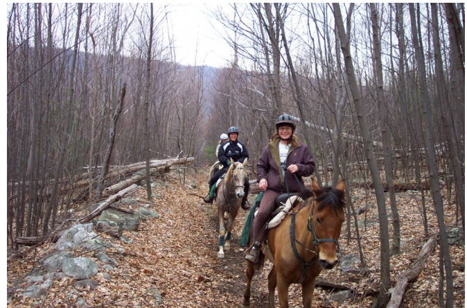
Along the North Mountain trail at No Frills

By the time 55 mile riders were hitting the first part of the 2 nd loop – a beautiful 25 mile stretch through some of the loveliest regions of West Virginia, the weather began to take a downward turn. Snow and sleet, gentle, but persistent, began to fall at the crest of the mountain, catching riders by