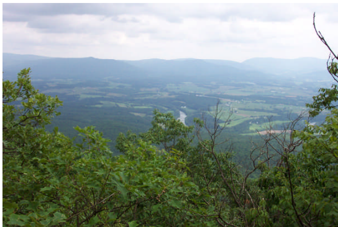
View of the Shenandoah Valley from the OD trail

The new trail, which is being configured by our own NC guru Bob Walsh, will be designed for a LD, 50, and 100 mile division. This is a gorgeous trail with some long fast stretches interspersed with some good climbs up and down the Massanutten. Be sure to bring your camera – the views are spectacular! The change in trail means that, this year, the Shenandoah River will be a pleasant view from the distance at the top of the Massanutten and from the spacious gravel roads alongside, rather than having to make the obligatory splashing route from bank to bank