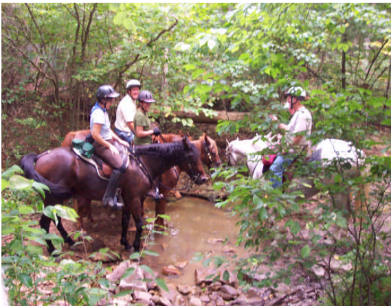
Some of the endurance wannabees participants at last year's Endurance Riding Clinic enjoying a refreshing pause in a creek after climbing up and down the Massanutts