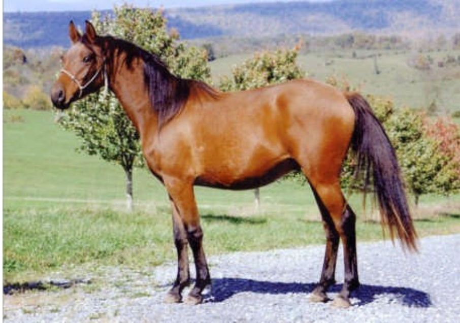
2007 Raffle horse - Legalas bay purebred Arabian gelding - foaled 2005 by Momentus MG out of BHR Lanna (*Tamerlan)

The Old Dominion Endurance Ride, Inc. is proud to present the 2007 Raffle Horse a purebred Arabian donated by Asgard Arabians, Inc.