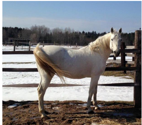
Need for Speed