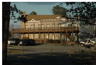
Clubhouse at Skyline Ranch Resort

Call for reservations at (540) 635-4169. Check out their website at skylineranchresort.com .